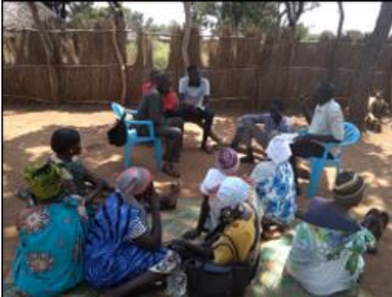
An STS training in one of the settlement camps.

the Bible storyteller shared from Matt 18 about forgiveness. After discussing it for an hour, he