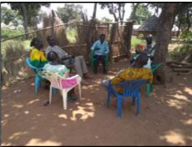
STS training in one of the settlement camps.

As of August 2018, the refugee crisis in Uganda grew to more than 1.5 million refugees! Seventy-one percent come from South Sudan and another 21% from the DRC. In this crisis, the Word of God has brought hope and healing to these displaced people. One of our leaders just returned to Uganda checking on the STS Oral Bible Schools in several camps, over seeing the instructors for STS training and showing God's Story to several thousand nearly every night in the camps!