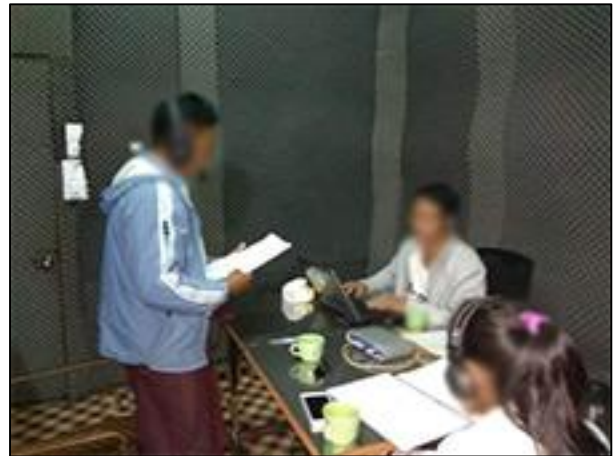
God's Story recording team.

The TGSP leadership in India met with STS leaders in the North and reported their gratefulness. One South India senior Pastor (bishop) shared, "The STS method of learning God's Word and going deep spiritually is a great gift from God in 21st century." Pray for our India Director and his many leaders as India becomes increasingly hostile to the Truth of Jesus Christ.